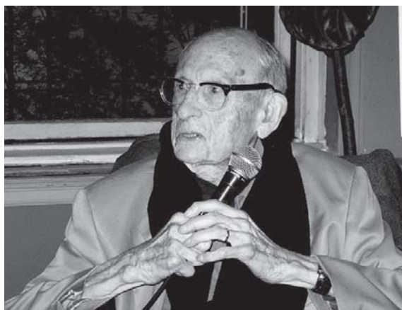
Artist Will Barnet speaks about the creation of the 2012 commissioned print.