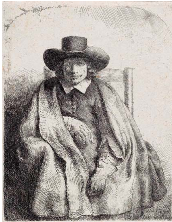
Clement de Jonghe, Printseller. Etching with drypoint and engraving, 1651. by Rembrandt van Rijn

Keeping Print Enthusiasts in Contact and Serving the Print Community Around the World