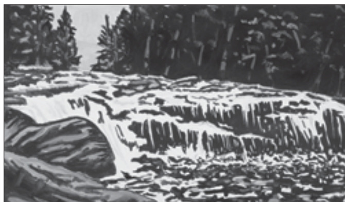
Richard Bosman, Buttermilk Falls , hand-colored pigment print, 2011

The Old Print Shop had a Martin Lewis "corner" with prices ranging from $30,000 – $60,000. Several Cassatt drypoints were available for $55,000 – $65,000. George Bellows' litho from 1916, Training Quarters , was going for $50,000, the same price as an Arthur Wesley Dow color woodcut, Lily , from c. 1893. There was a section of white line woodcuts, with images by Blanche Lazzell commanding top dollar at $150,000. Also on display were prints by